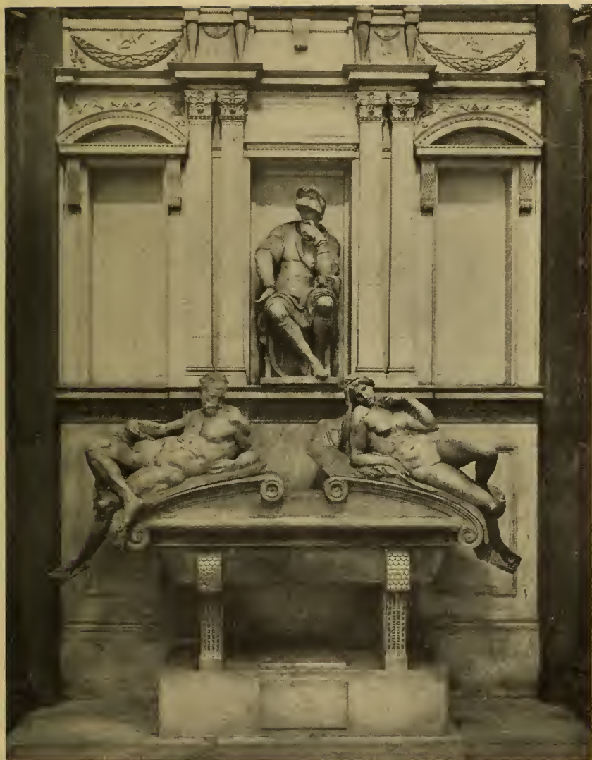
THE TOMB OF LORENZO DE' MEDICI, DUKE OF URBINO

BY MICHELANGELO IN THE NEW SACRISTY OF S. LORENZO